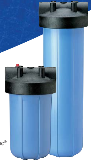
#10 Big Blue®